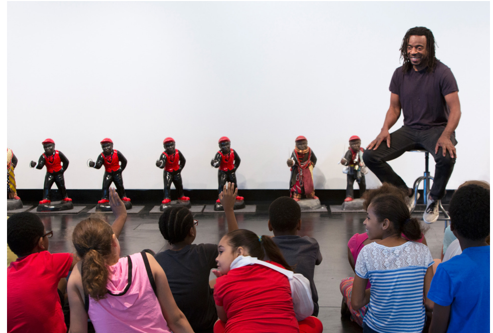
Artist Willie Cole speaks to Hamilton Elementary students, Tang Teaching Museum, 2017

For more information on their research, please see the bibliography page or visit their website: www.vtshome.org