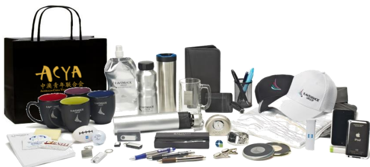
A sample of goods you can provide for our promotional gift bags or raffle.