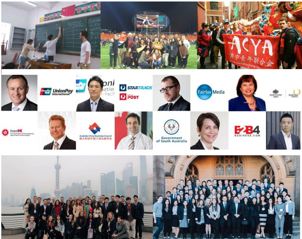
From top to bottom: ACYA volunteer teachers in Leizhou; ACYA at an AFL game, free tickets from our AFL sponsors - The Giants; ACYA at Chinese New Year festival; A brief collection of companies and speakers at ACYA run or facilitated events; ACELS 2016 in Shanghai; ACELS 2015 in Sydney.

ACYA and its members have been a part of numerous events either held by ACYA or one of their partner organisations. Below are the following photos from events that ACYA participated or helped facilitate for a partner organisation. At ACYA we have three focus areas, Education, Cultural, and Professional; hence our education based opportunities, cultural exploration, and professional prospects.