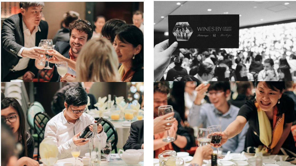
Clockwise from top left: VIP guest speakers enjoying Wines by Geoff Hardy; promotional cards handed out at every table; a toast by a VIP guest being made with Geoff Hardy wines; a guest examining the branding to purchase in the future.

Our latest successful sponsorship example comes from our recent Annual ACYA NSW Banquet held in Sydney CBD. Focusing on one of our sponsors, Geoff Hardy Wines, they had significant awareness produced for their blossoming brand to numerous guests. Many of the guests were from a range of industry professional backgrounds such as investment banking and international business, and through this they were able to sample the varieties of wine provided and were also able to take home promotional business cards. Geoff Hardy was a Silver sponsor for the event, and were then known for their flawless wines and association with ACYA.