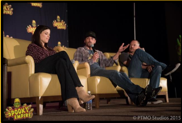
Original Scream Cast, Neve Campbell, Skeet Ulrich, Matthew Lillard