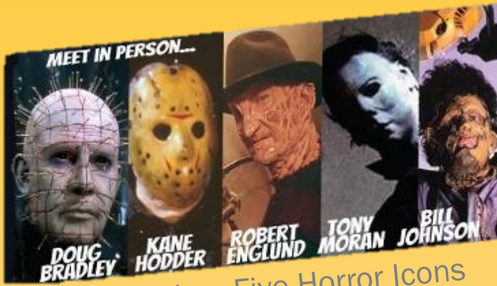
The Legendary Five Horror Icons