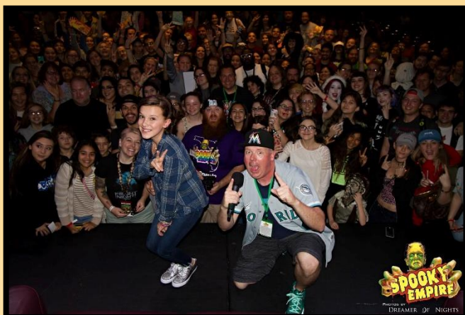
Stranger Things cast Millie Bobby Brown, Gaten Matarazzo, Caleb McLaughlin, Finn Wolfhard