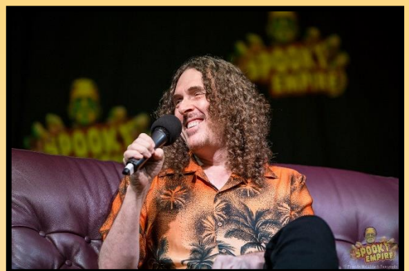
Weird Al Yankovic