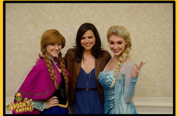
Lana Parilla, Once Upon A Time