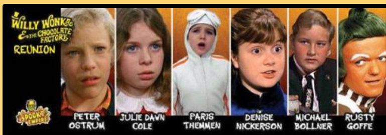
Willy Wonka and The Chocolate Factory Cast