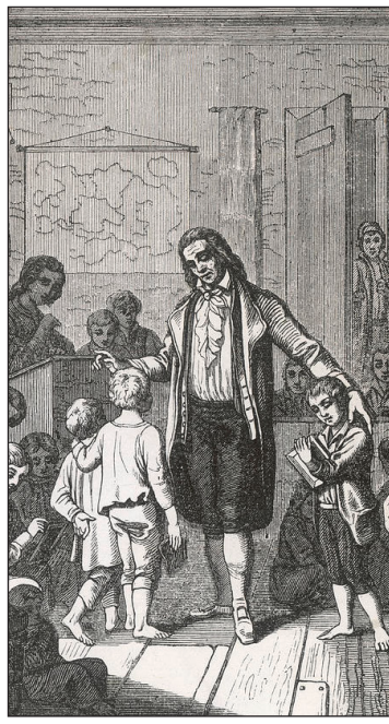
Educational reformer Johann Heinrich Pestalozzi. fineartamerica.com

Accordingly the school for outsiders should act not only as a safe haven but also the prompt to invent new scenarios for maximizing building usage on a 24-hour cycle.