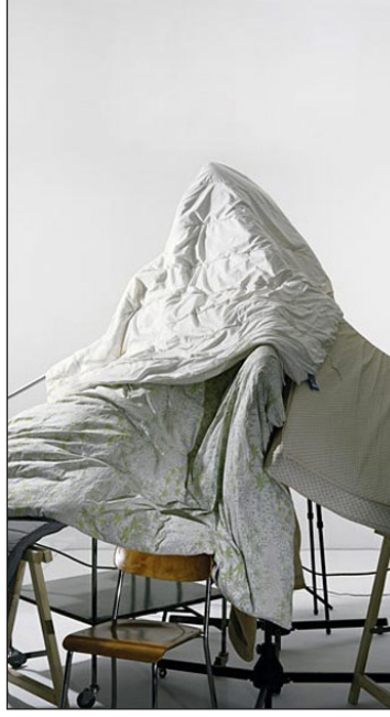
Pour Elca, Gneborg. schweizerkulturpreise.ch

Conventionally this could be a book to be printed and published for studio participants and/or the general public, alternatively the studio may decide to work within another form of media to celebrate our collective work.