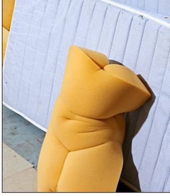
Mousse, Etienne Gros picgra.com

Finally, while the building itself may be razed, studio participants are encouraged to think about the recycling of the building in its parts to be reused as elements of the new architecture in an attempt to retain the spirit and elemental composition of the original construct.