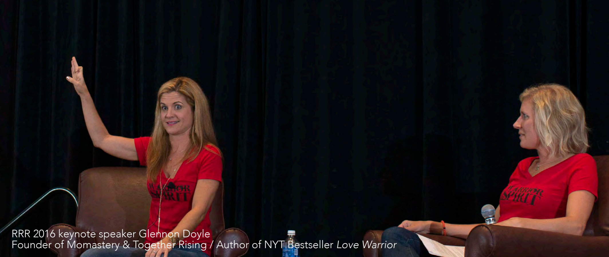
RRR 2016 keynote speaker Glennon Doyle Founder of Momastery & Together Rising / Author of NYT Bestseller Love Warrior