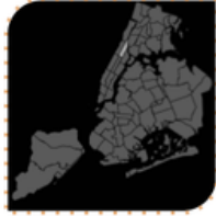
Potential CLT Site: 2136 Frederick Douglass Blvd. (Near W. 116th & FDB)