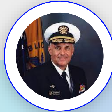
Dr Richard Carmona