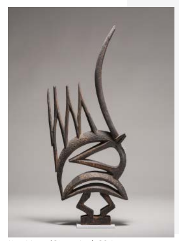
Headdress (Ciwara kun), 20th century. Bamana peoples. Mali, Bougouni Region. Wood, 25\% \times 10\% \times 2i n. ( 65.7 \times 26 \times 5.1 cm). The Menil Collection, Houston.