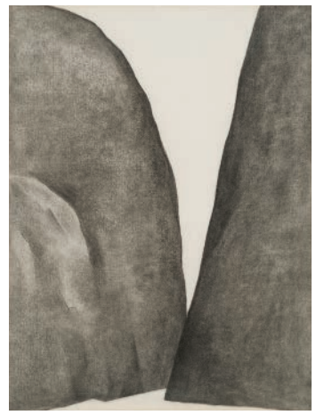
Georgia O'Keeffe, From a River Trip, 1962. Promised gift of Janie C. Lee.

The museum houses nearly 2,000 drawings at the Menil Drawing Institute, which was designed by the architects Johnston Marklee and opened in 2018. The freestanding building makes innovative use of natural light and is designed around three tree-filled courtyards. The galleries provide an intimate setting for the public to interact with the drawing collection and changing exhibitions. The drawing institute is devoted to teaching, research, exhibition, storage, and conservation of works on paper, substantiating the Menil's dedication to artists and their creative thought and process.