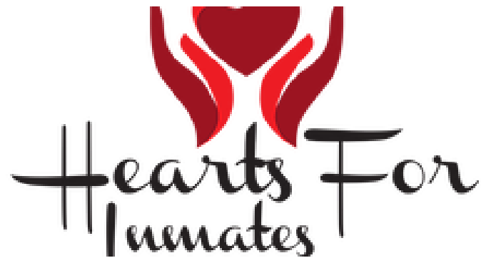
HEARTS FOR INMATES

The mission of HEARTS FOR INMATES is to Help, Encourage, Aspire, Redeem, Trust and provide Support for both short and long term individuals who are incarcerated. We do this by advocating for changes within South Carolina legislation and policy changes within South Carolina The Department of Corrections and the Department of Pardon Probation and Parole.