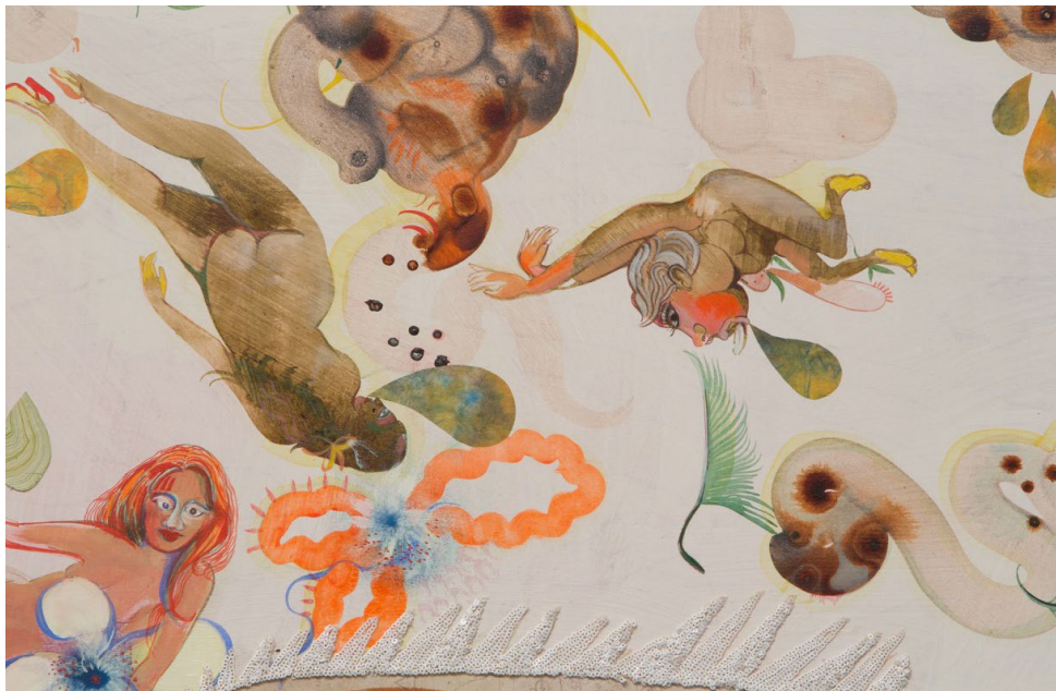
Rina Banerjee, Mother gathered Three . . . or no more daughters (detail), 2017, acrylic and collage on wood panel, 79 x 39 inches, courtesy of the artist and Galerie Nathalie Obadia, Paris/Brussels