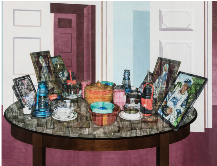
Njideka Akunyili Crosby, The Twain Shall Meet , 2015, private collection