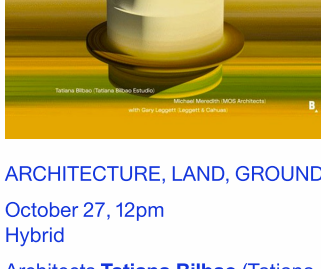
ARCHITECTURE, LAND, GROUND

2022 Plein Air Talks is organized in conjunction with the advanced studio series “Plein Air” taught by Nahyun Hwang, initiated in the fall of 2020. The series explores the complex material and socio-political performance of air, and the intersectional vulnerabilities and agencies of air as a critical spatial medium.