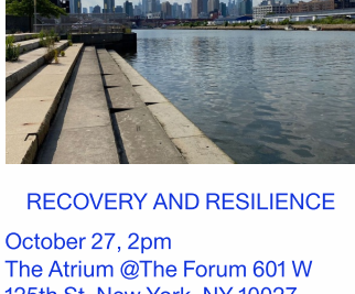
RECOVERY AND RESILIENCE

Organized by the Buell Center as part of the “Conversations on Architecture and Land in and out of the Americas” series.