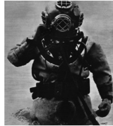
A Deep sea diver