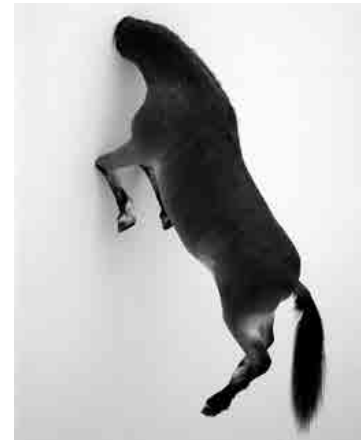
B Novecento by Maurizio Cattelan / 1997