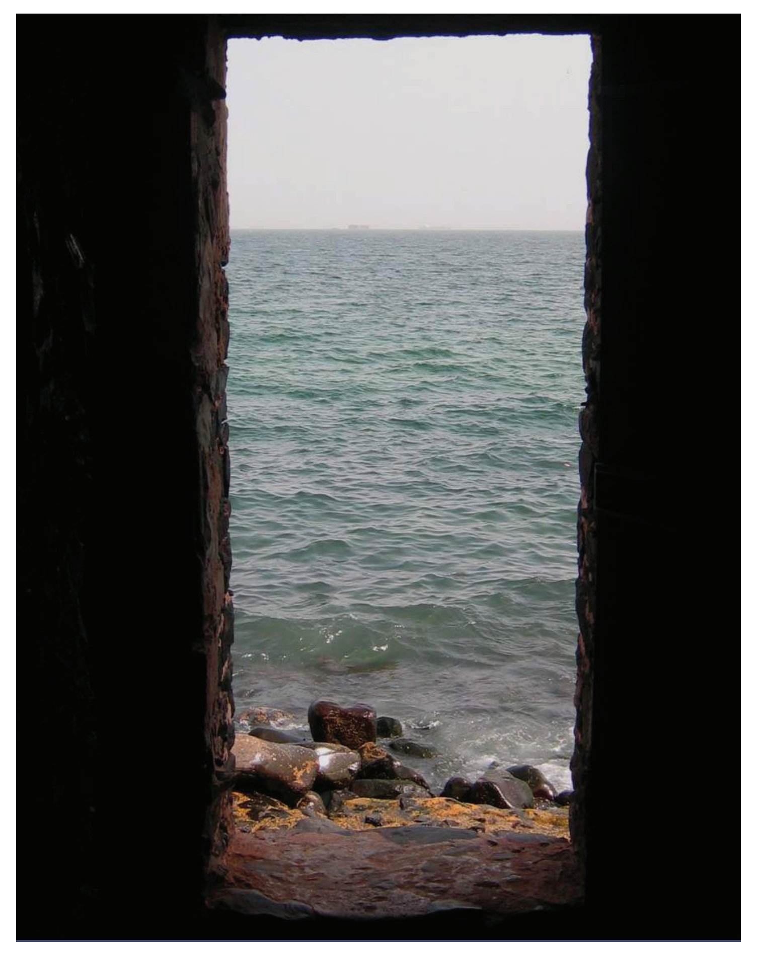
Figure 4: The Door of No Return