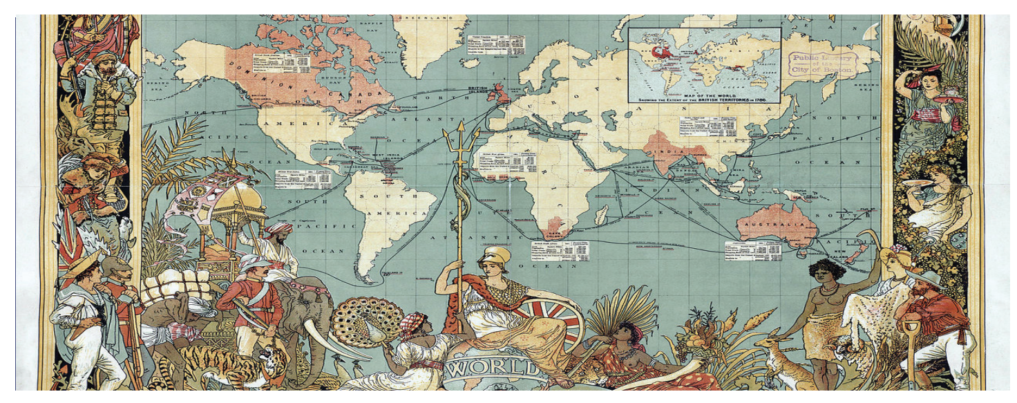
Figure 1: Map of the World Showing the Extent of the British Empire in 1886