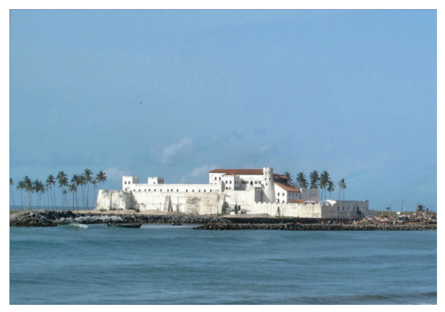
Figure 3: Elmina Castle