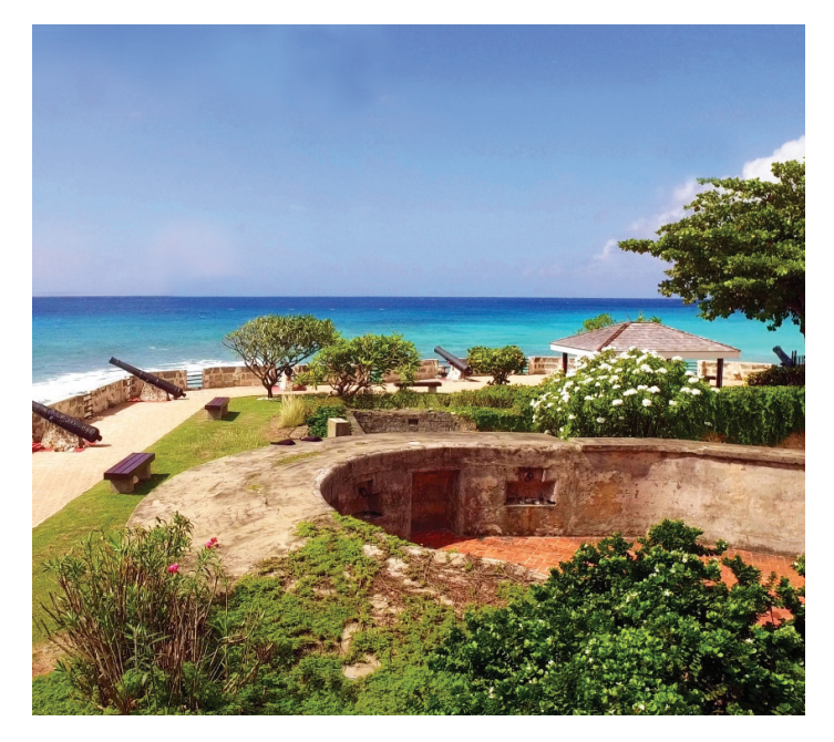
Figure 2: Charles Fort

occupied the country since the 17th century. Their interests stemmed from trade as did the Dutch and Swedish, however, the introduction of the Trans-Atlantic slave trade brought a need for the UK to cement their rule. This resulted in the wars with the Ashanti Kingdom and involvement in local disputes like the Ashanti-Fante War. The latter saw the British capturing and holding the Fante chief in one of their forts before handing him over to the Ashanti and deciding the fate of the war. Occupation by the British was filled with a series of wars and negotiations that put the local forts to use. Things calmed down by the early 20th century but then, the country was united in the goal of independence.