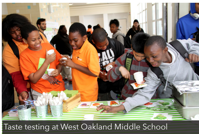
Taste testing at West Oakland Middle School