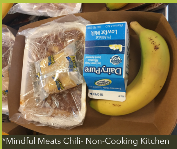
*Mindful Meats Chili- Non-Cooking Kitchen

"You will see that some of them literally pick up their lunch and put it in the share bin and they don't even try it. Just because the option is so unappealing to them. And, to me that's devastating because they don't even want to try it. And then so they're going literally the whole day [without eating]."