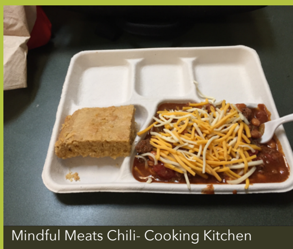
Mindful Meats Chili- Cooking Kitchen

* For more information about this meal, see article "OUSD Beefs Up School Lunch with Meat from Retired Dairy Cows", https://bit.ly/2BIEwHt