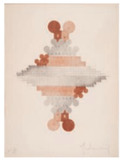
Claes Oldenburg, Geometric Mouse Pyramid as an Image of the Electoral System, Doubled, 1976. Color lithograph, 35 \times 26 inches ( 88.9 \times 66 cm). The Menil Collection, Houston, Promised gift from the Collection of Louisa Stude Sarofim.

The geometric mouse is deeply rooted within Oldenburg's larger practice of engaging metropolitan environments and embedding his art into the fabric of everyday life. For his 1967 exhibition at the Museum of Contemporary Art, Chicago, the artist submitted a set of drawings and collages that proposed a mouse façade for the building. In 1969, to publicize his retrospective at the Museum of Modern Art, New York, Oldenburg made several enormous Geometric Mouse Banners , which were hung on the exterior of the museum. He used printmaking to ensure that his art circulated in the public sphere, for example, the lithograph Geometric Mouse Pyramid