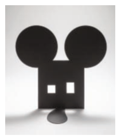
Claes Oldenburg, Model for a Geometrically Formed Mouse, 1975. Steel and paint, 2\times23\%\times15\% inches (5.1\times60.6\times38.7\ cm) . The Menil Collection, Houston, Promised gift from the Collection of Louisa Stude Sarofim.

American artist Claes Oldenburg (b. 1929) established himself as one of the progenitors of Pop Art during the 1950s and 1960s with his soft sculptures of everyday objects and installations that celebrated urban life. Artists then were increasingly taking inspiration from advertising and the media, and Oldenburg became intrigued by the ubiquity of Mickey Mouse in popular culture, first incorporating the image into his work in 1963. Claes Oldenburg and the Geometric Mouse presents drawings, prints, and sculptures related to the development of his version of the mouse throughout the 1960s and 1970s.