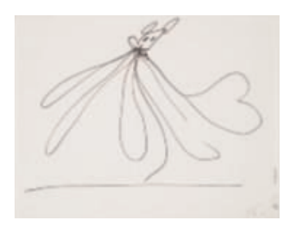
Claes Oldenburg, Notebook Page: Mouse Kite (Study for Poster), 1969. Ink on paper, 8\frac{1}{2} \times 11 inches (21.6 × 27.9 cm). The Menil Collection, Houston, Promised gift from the Collection of Louisa Stude Sarofim.

Oldenburg frequently uses drawing to generate ideas. As he reduces complex images to simple geometric forms, he discovers visual affinities—"rhymes" he terms them—in the unexpected slippages and mutations of his sketches. Notebook Page: Mouse Head Variations , 1966, reveals how the act of putting pen to paper led the artist to find corresponding shapes and structures between the mouse and a film projector. Oldenburg often expressed these formal connections as an equivalency, as seen in the title of the lithograph M. Mouse (with) 1 Ear (Equals) Tea Bag , 1973, in which the mouse head is transformed into a square pouch.