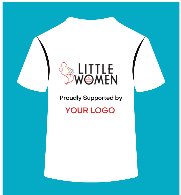
Mock Up Production Tshirt- Emergent Academy Students