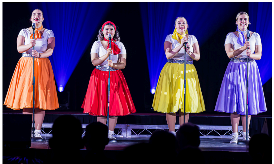
Diploma 2023 students perform “Mr Sandman”