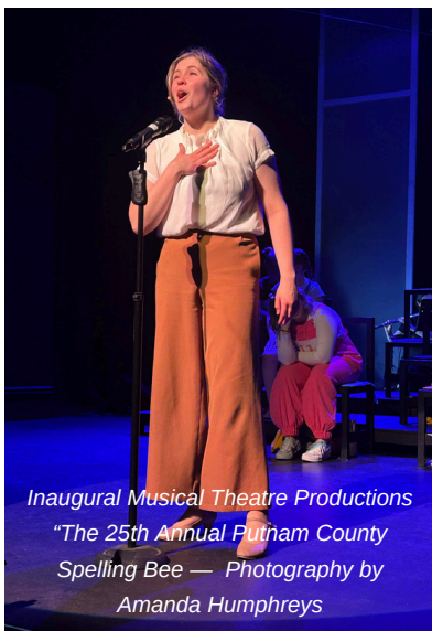
Inaugural Musical Theatre Productions "The 25th Annual Putnam County Spelling Bee