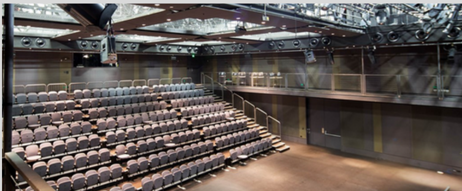
STUDIO UNDERGROUND- The City of Perth