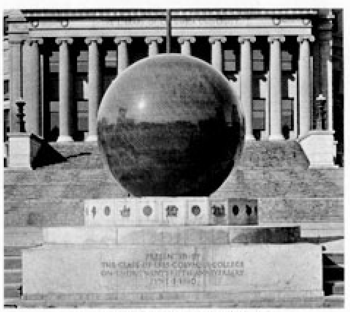
FIG. 1. GENERAL VIEW OF THE MONUMENT

The dark green granite sphere which stands on the south side of 116th Street, midway between Broadway and Amsterdam Avenue, has been erected by surviving members of the class of 1885, Columbia College, to mark the twenty-fifth anniversary of their graduation. It was designed by Messrs. McKim, Mead and White, architects to the University, and was planned to be primarily an ornamental monument. To give it additional interest and educational value, the sphere has also been made the gnomon or stylus of a sundial.