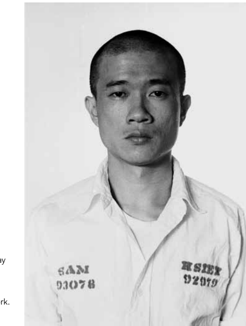
Tehching Hsieh, One Year Performance 1978–1979, 365-Portrait, Day 1 and Day 365. Gelatin silver prints, 55/8 x 4 inches each.

Silence can also catalyze states of consciousness. For One Year Performance 1978–1979, Tehching Hsieh locked himself in a cage in a Manhattan loft for twelve months, refraining from conversing, reading, watching television, or listening to the radio. While eschewing the spiritual practices of hermits or monks who take vows of silence, Hsieh used quiet and isolation to strip life to its basics. Theresa Hak Kyung Cha's video Mouth to Mouth , 1975, employs images of the artist's mouth, Korean script fragments, and video static, accompanied by the quiet sounds of running water, to compose a deeply personal representation