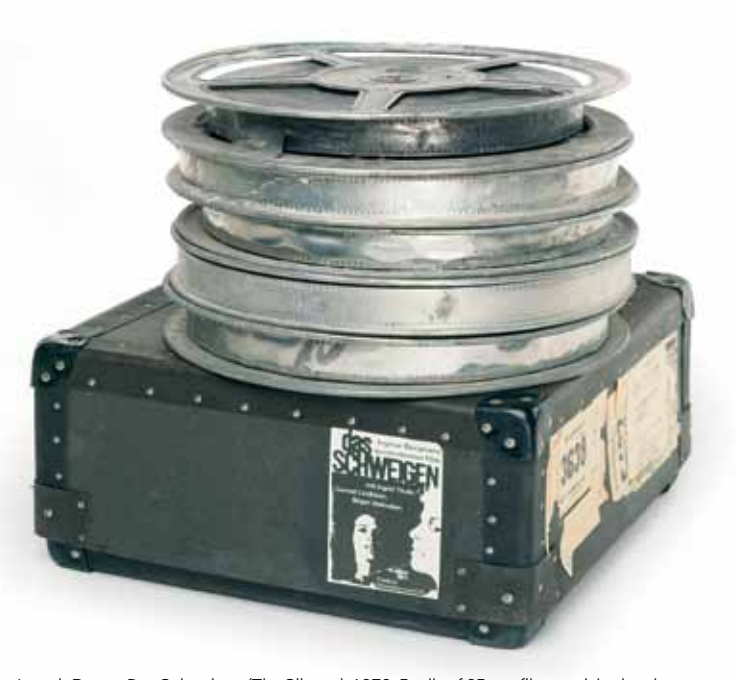
Joseph Beuys, Das Schweigen (The Silence) , 1973. 5 rolls of 35mm film varnished and galvanized in copper and zinc, height: 15 inches, reels: 7½ inches diam. Collection Walker Art Center, Minneapolis, Alfred and Marie Greisinger Collection, Walker Art Center, T. B. Walker Acquisition Fund, 1992. © 2012 Artists Rights Society (ARS), New York/VG Bild-Kunst, Bonn

As the critic Susan Sontag noted in her 1967 essay "The Aesthetics of Silence," pure abstraction can be akin to silent prayer—a proposition made manifest in the paintings by Mark Rothko in the Rothko Chapel,