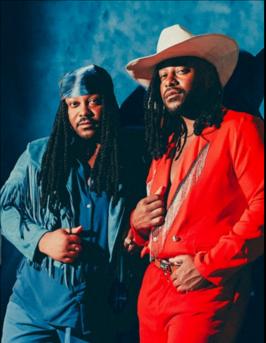
The Kentucky Gentlemen

*Click On Picture To Get A Preview of Artist*