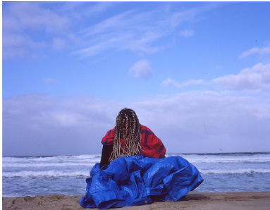
between a whisper and a cry , 2019