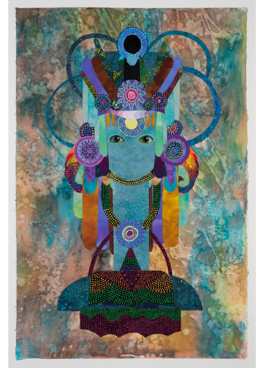
Saya Woolfalk, Untitled #7 , 2015, from the ChimaTEK series, mixed media collage on paper, courtesy of Leslie Tonkonow Gallery

In The Four Virtues (Prudence) and in other work, Woolfalk envisions a utopian or perfect world that reflects our ever-growing multi-cultural world. Her research includes working with scientists to figure out how, on a biological and genetic level, humans could merge with the natural world. These collaborations form the basis of her visions for the future!