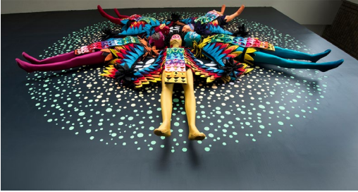
Saya Woolfalk, The Empathics: Star Compulsion , 2012, installation view, Montclair Art Museum

In The Four Virtues (Prudence) and in other work, Woolfalk envisions a utopian or perfect world that reflects our ever-growing multi-cultural world. Her research includes working with scientists to figure out how, on a biological and genetic level, humans could merge with the natural world. These collaborations form the basis of her visions for the future!