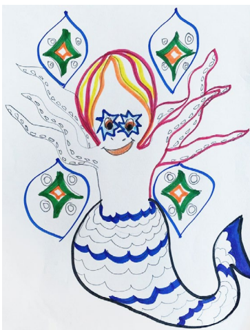
Artwork by Sunny Ra

Suggested Materials: Pencil, magazines, newspapers, colored pencils, markers, various kinds of paper, scissors—use whatever you have available!