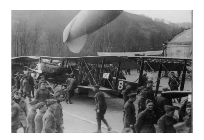
Terry Adkins Flumen Orationis (from The Principalities), 2012 single-channel video with sound Gift of the Estate of Terry Adkins 2017.10