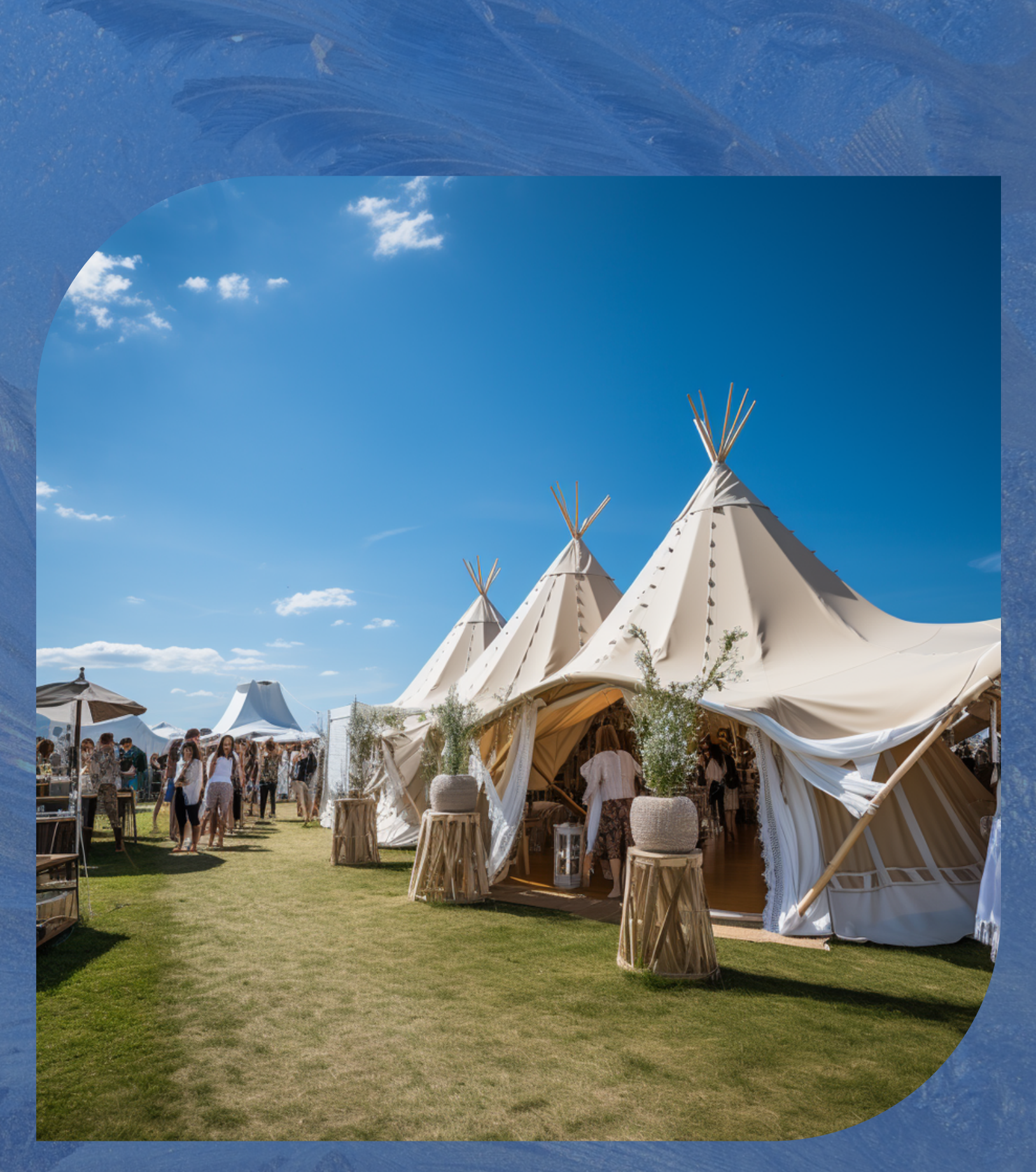
Example Design Renders

Branded Presence: Name, Platinum, Gold Sponsors Premium exhibition space in a high-traffic area, allowing for an immersive brand experience and direct engagement with festival attendees.