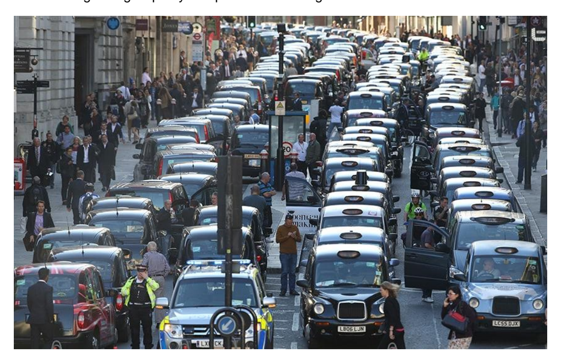
Anti-UBER protest, London, August 6, 2017

The current disparity of wealth and extreme inequality are understood as obstacles in the advancement of such a fluent society. While few have multiple, luxurious, unused homes, many more become homeless, suffering in the face of growing environmental extremes. Formulating affordable housing solutions in the face of this growing disparity has proven a challenge.