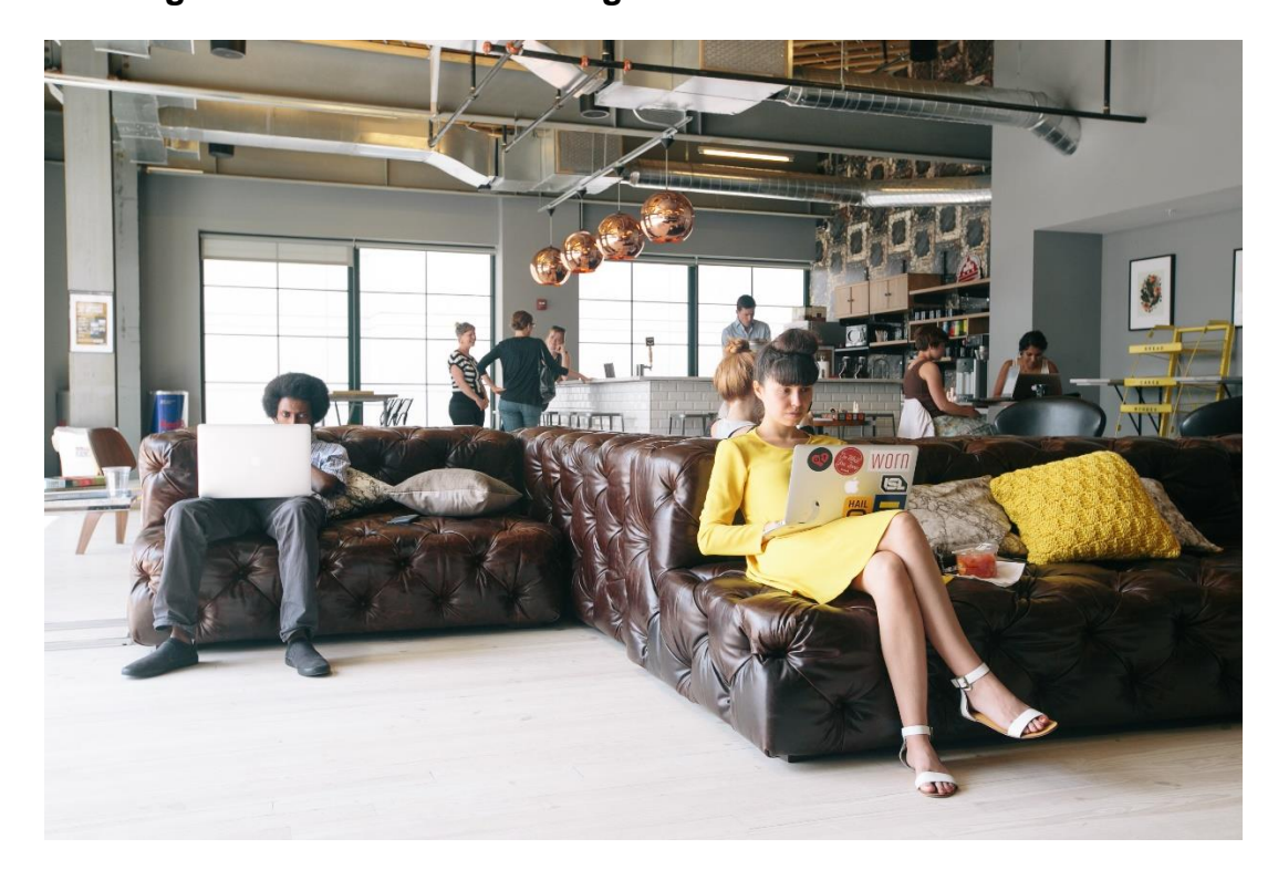
Interior, WeWork, Washington DC